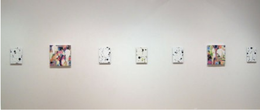
“Small Paintings” 2009 Installation view Courtesy Leo Kamen Gallery